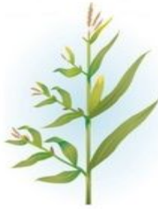
Mutated Hybrid (Primitive or Intermediate Maize) Natural Landrace