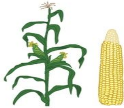
Maize (Modern Corn)