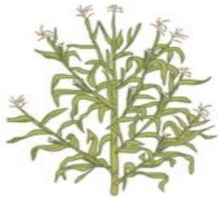
Teosinte (Wild Plant - Zea Mays)